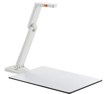
Optional Writing Whiteboard